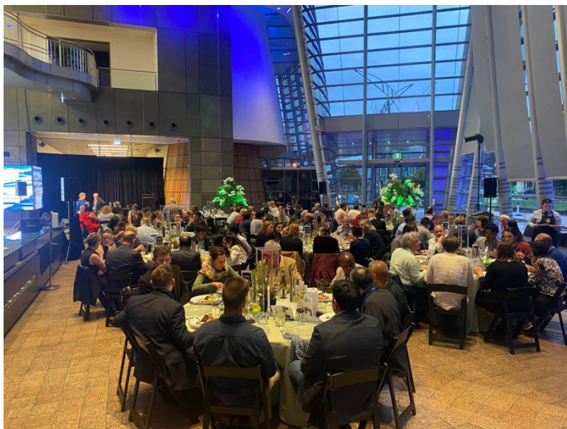
A chance to connect at the conference dinner