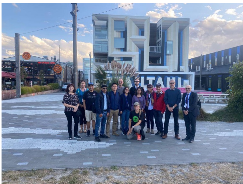
One of the walking tour groups takes a break during the Social Evening